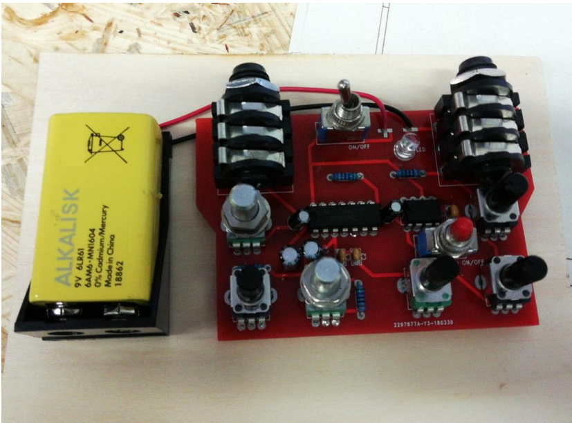
Screamo: a rather wild, almost dangerous distortion by Alwin Weber.

The Sound Campus team is looking forward to seeing you!